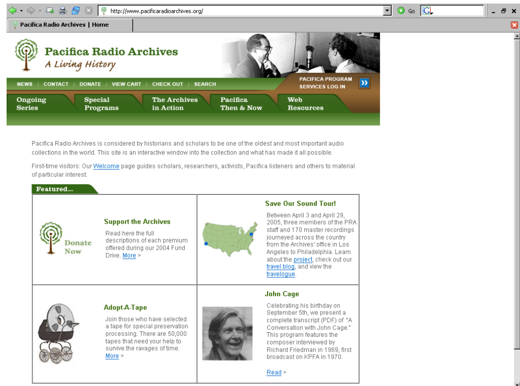
The Pacifica Radio Archives home page. The home page upper banner, which contains branding for the Archives as well as site navigation, is used on all pages on the site.

Branding, or “look and feel,” is important for Web sites. It not only establishes a familiar face for the visitor, it is an aid to navigation in an environment where clicking on a link can take the visitor to an entirely different Internet site. Web sites regularly provide general navigation aids on each page of their site, allowing visitors to understand where in the site they currently are and giving them a quick route to other parts of the site. The Pacific Radio Archives Web site uses both branding and navigation to full advantage.